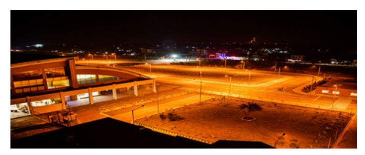
Fig. A night view of Guatam Buddha International Airport

To attract more international airlines to our newly constructed international airports in Bhairhawa and Pokhara, the government has exempted VAT and service tax. Additionally, the fees previously charged by the Tourism Board and Civil Aviation Authority have been reduced, leading to an increase in the number of flights and a decrease in flight costs. There are also discussions about potentially lowering the cost of aviation fuel for international flights to further attract airlines.