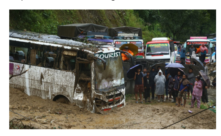
Fig. Incident at Jhyaple khola claiming many lives in the mud slide

On July 12, 2024, two buses carrying a total of 65 passengers were swept away in Trishuli River. The search and rescue operation went on for a month, with bodies still being recovered from various locations. Only 3 individuals fortunate enough to survive. A report attributed the landslide to the haphazard construction of local roads in the hills by local bodies. This underscores the critical safety issue associated with the condition of highways and their vulnerability during time of the year, demanding significant relevant attention from departments and engineers.