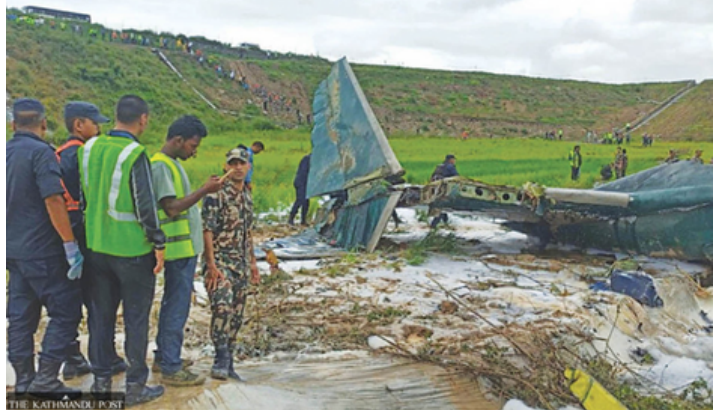
Fig. Plane Crash inside Tribhuvan International Airport claiming 18 lives

In the 3rd quarter of this year (July to September), Nepal experienced its worst. Frequent crashes, landslides, and road washouts were reported all over the country. Nepal witnessed two aircraft crashes, resulting in 18 and 5 fatalities on 24th July 2024 and 7th August 2024, respectively. The air crash at Tribhuvan International Airport involved a Saurya Airlines aircraft, which tragically claimed 18 lives, with only the pilot surviving. Initial investigation pointed to faults from the Civil Aviation Authority of Nepal (CAAN) and the airline operators. It was found that the airspeed and takeoff weight were mismatched, causing an aerodynamic stall. Additionally, the operator's speed card for a takeoff weight of 18,500 kgs indicated an incorrect takeoff speed (The Kathmandu Post, 6th September 2024). In another incident, a helicopter belonging to Air Dynasty crashed in August in Shivapuri National Park, resulting in the deaths of 5 people, including 4 Chinese nationals. These incidents highlight the urgent need for interventions in Nepal's aviation sector, including policy improvements, enhanced monitoring, and effective implementation.