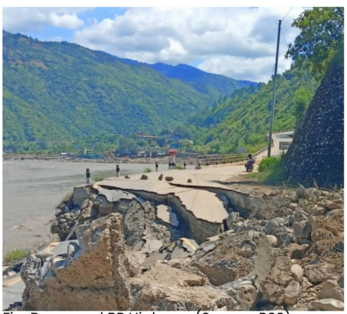
Fig. Damaged BP Highway Home Ministry Direct Public Transport Service Providers

Tatopani trade route was washed away, causing substantial economic losses. Furthermore, flooding in various rivers inundated settlements in the valley, affecting residents of the Kathmandu Valley. These unexpected climatic events, as floods, heavy rains, landslides, have significantly impacted the entire nation. Given that many bridges experienced flow above their design high flood level (HFL), there is an urgent need for climate change adaptive structures to ensure safe and resilient transportation in the country.